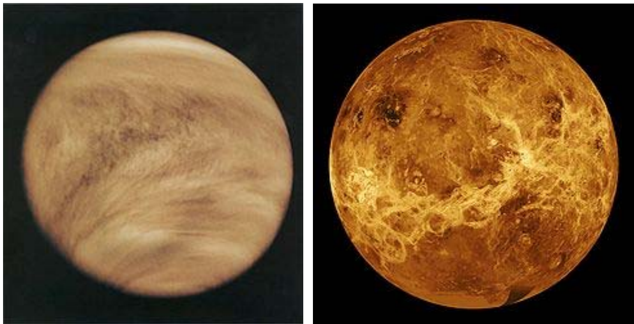
Pioneer Venus (atmosphere) and Magellan (surface) views of Venus.